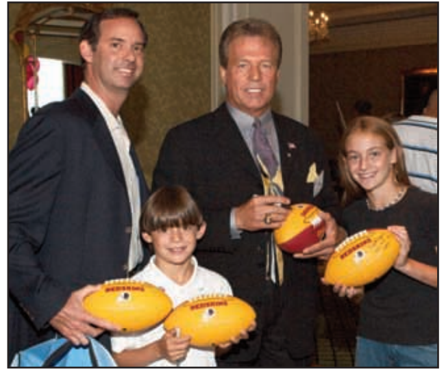
Mark Moseley with Fans.