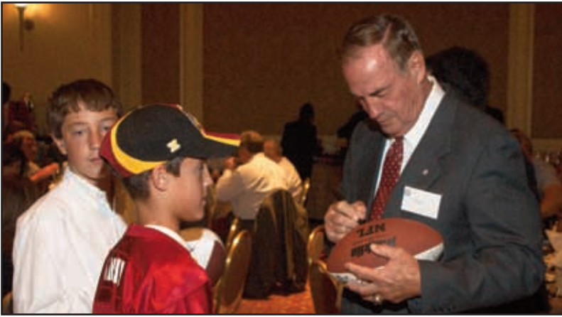
Sam Huff (HOF) signs for fans.