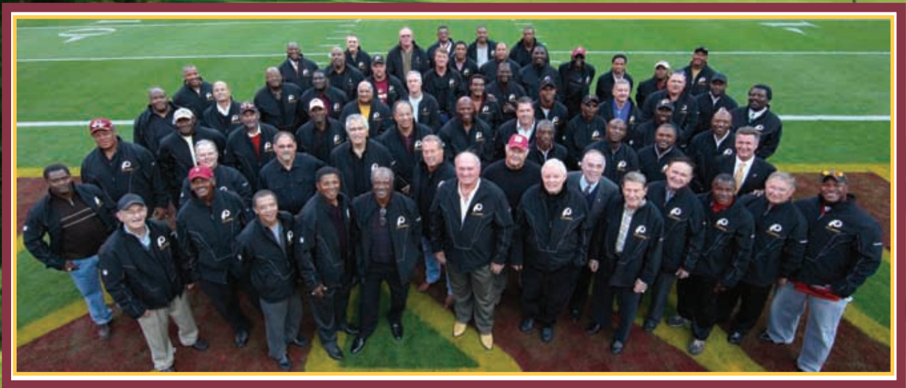
Washington Redskins Alumni